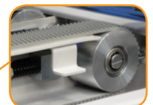
Self-tensioning & self-tracking drive belts simplify belt replacement