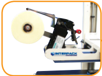
Tip up top tape head simplifies roll replacement