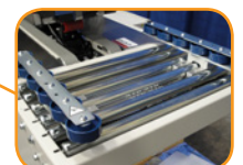
Horizontal centering guides with rollers