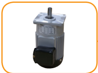
One 1/3 HP motor, and one 1/4 HP motor