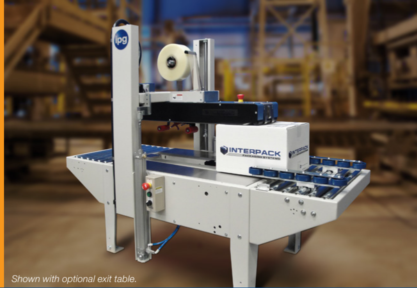
Shown with optional exit table.