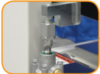
Selectable minimum height