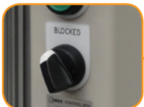
"Blocked" button for jams & replacing bottom tape roll